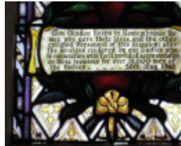
South Melbourne St Paul Uniting Joshua inscription 2