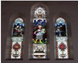
South Melbourne St Paul Uniting Joshua and Dorcas