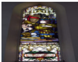
South Melbourne St Paul Uniting Faithful Knight