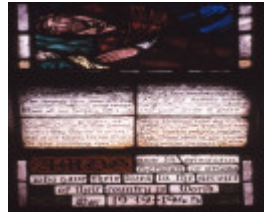
Gardiner St Andrews Uniting Church Jacobs Ladder detail DTK 1950