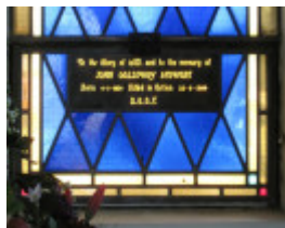
Tatura St Andrews Presbyterian Church Cross of St Andrew inscription 2