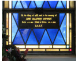
Tatura St Andrews Presbyterian Church Cross of St Andrew inscription 2