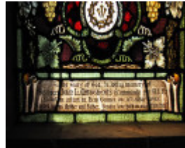
Tatura St Andrews Presbyterian Church Do this in Remembrance of Me inscription