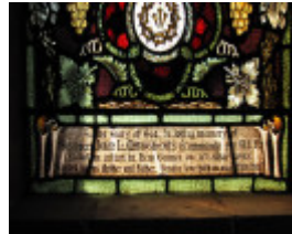
Tatura St Andrews Presbyterian Church Do this in Remembrance of Me inscription