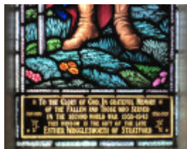
Stratford Uniting Church Jonathan inscription