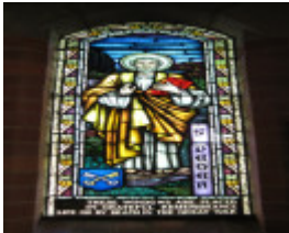
Shepparton St Augustine's Anglican St Peter