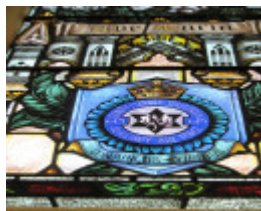
Yarraville St Augustines Catholic Church Our Lady of the Sky County Surrey Squadron AAF BR 1945