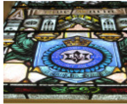
Yarraville St Augustines Catholic Church Our Lady of the Sky County Surrey Squadron AAF BR 1945