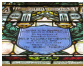
Yarraville St Augustines Catholic Church Our Lady of the Sky inscription BR 1946