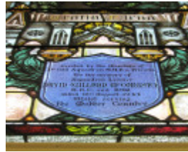
Yarraville St Augustines Catholic Church Our Lady of the Sky inscription BR 1946