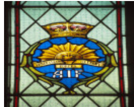
Hawthorn St Columbs Anglican WWII C1950 detail