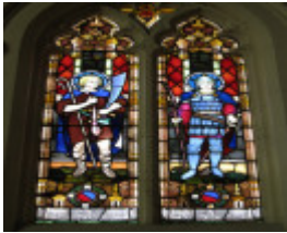
Essendon St Johns Uniting David and Jonathan