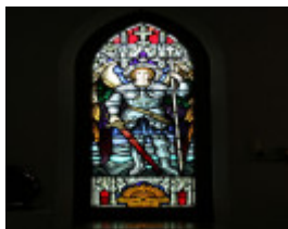
St Helena St Katharines