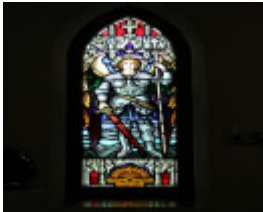
St Helena St Katharines