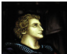
White Hills Anglican Church, Faithful Knight detail, Brooks, Robinson & Co., c1918