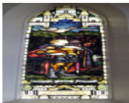
White Hills Anglican Church, Faithful Knight, Brooks, Robinson & Co., c1918