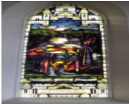
White Hills Anglican Church, Faithful Knight, Brooks, Robinson & Co., c1918