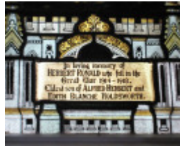
White Hills Anglican Church, Faithful Knight inscription, Brooks, Robinson & Co., c1918