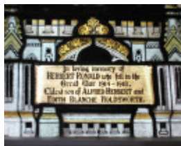
White Hills Anglican Church, Faithful Knight inscription, Brooks, Robinson & Co., c1918