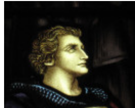
White Hills Anglican Church, Faithful Knight detail, Brooks, Robinson & Co., c1918