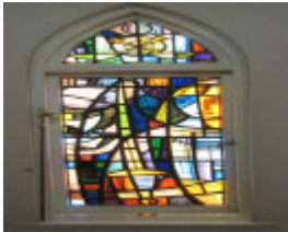
Mildura St Margarets Anglican Church Henshall memorial