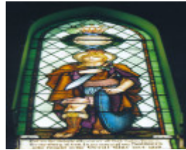
Leopold St Marks WWI 1919 2