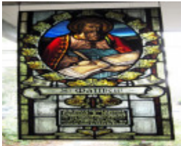
Wheeler's Hill St Matthews St Matthew