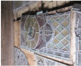
Euroa St Pauls Anglican Church former east window Euroa Hist Soc (4)