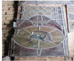
Euroa St Pauls Anglican Church former east window Euroa Hist Soc (7)