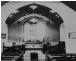
Euroa St Pauls chancel 1903