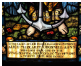
Myrtleford St Pauls Church Hope inscription