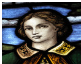
Myrtleford St Pauls Church Hope detail