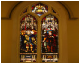
Geelong St Pauls Anglican Sts Michael George & G - Copy