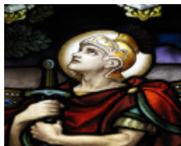
Myrtleford St Pauls Church Faith in Armour detail 1