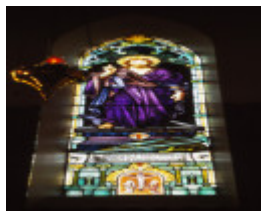
Ballarat St Peters Anglican Church, Resurrection, Brooks, Robinson & Co. 1919