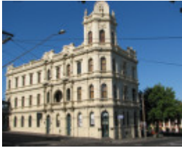
CANTERBURY MANSIONS SOHE 2008