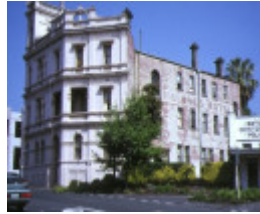
1 canterbury mansions canterbury side view