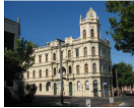
CANTERBURY MANSIONS SOHE 2008