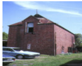
canterbury mansions canterbury stables dec1990