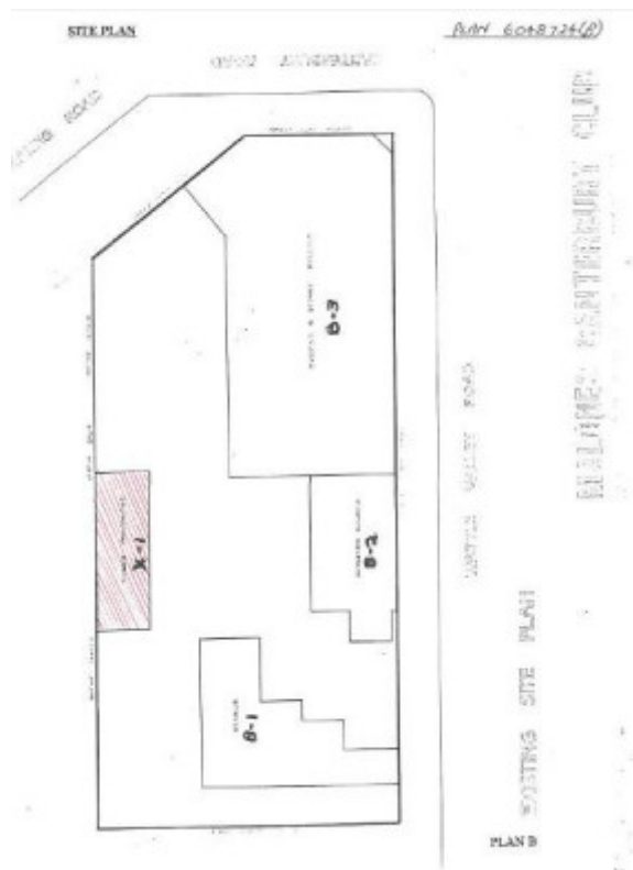
canterbury mansions planB.JPG