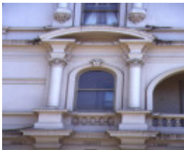
canterbury mansions canterbury detail of window