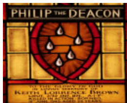
Portland St Stephens Anglican (2)