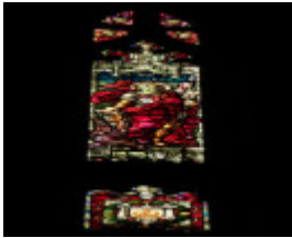
Parkville Trinity College Chapel Jowlett RB