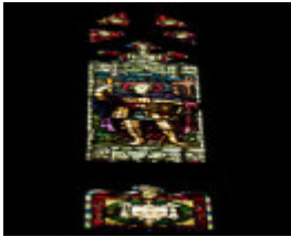
Parkville Trinity College Chapel Miller RB