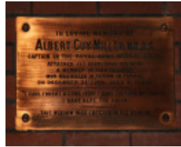
Parkville Trinity College Chapel Miller plaque RB