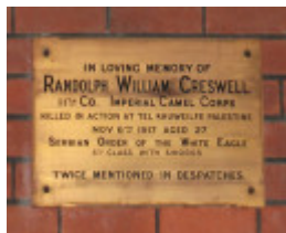
Parkville Trinity College Chapel Cresswell plaque RB