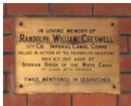
Parkville Trinity College Chapel Cresswell plaque RB