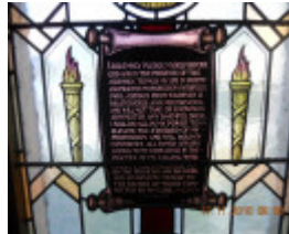
Warrnambool Base Hospital Mona Wilton memorial, nurses' pledge, Mathieson and Brooks, Robinson & Co., 1953