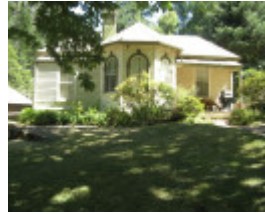
PROV H2204 _Duneira_gate lodge_19 Jan 09 61