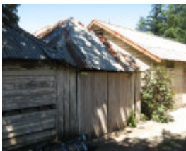
PROV H2204_Duneira_milking complex_19 Jan 09 120