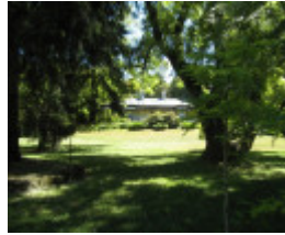
PROV H2204_3897 Duneira_house across front lawn_19 Jan 09 70