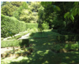
PROV H2204_secret garden_ Duneira_19 Jan 09 43