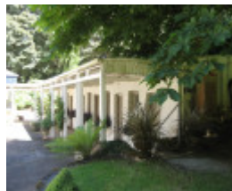
PROV H2204_Duneira_service block_19 Jan 09 96