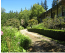
PROV H2204 _Duneira_Mt Macedon_19 Jan 09 75