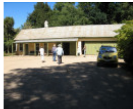
PROV H2204_Duneira_stable_19 Jan 09 32