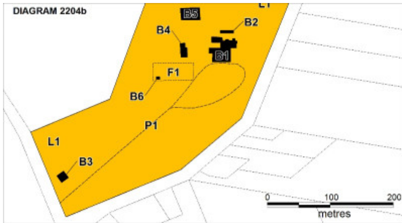
Duneira Mt Macedon Feb 2009 Plan B