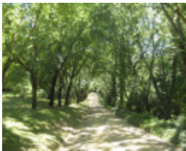
PROV H2204_Duneira_elm drive_19 Jan 09 65