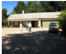
PROV H2204_Duneira_stable_19 Jan 09 32