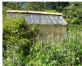
PROV H2204_Duneira_glass house_19 Jan 09 48