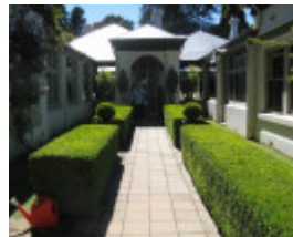
PROV H2204_Duneira_new entrance to house_19 Jan 09 27