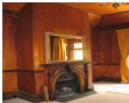
Karori drawing room