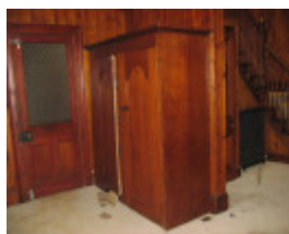
Karori built in cupboard and stair