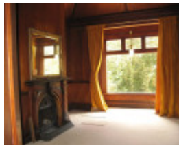
Karori dining room