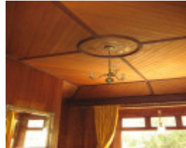
Karori drawing room ceiling