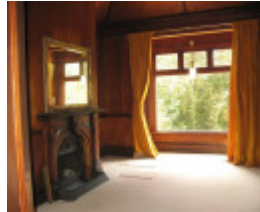
Karori dining room