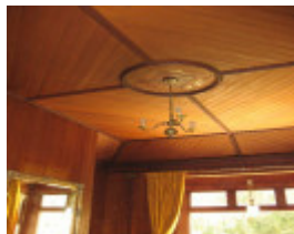
Karori drawing room ceiling