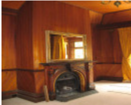
Karori drawing room