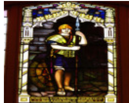
Trentham St Georges Anglican Faithful Unto Death BR 1947.jpg