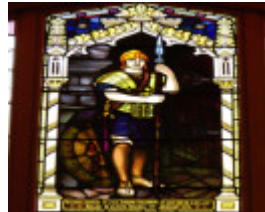
Trentham St Georges Anglican Faithful Unto Death BR 1947.jpg