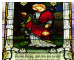
Trentham St Georges Anglican Church, Light of the World central panel, Brooks, Robinson & Co. 1926-27