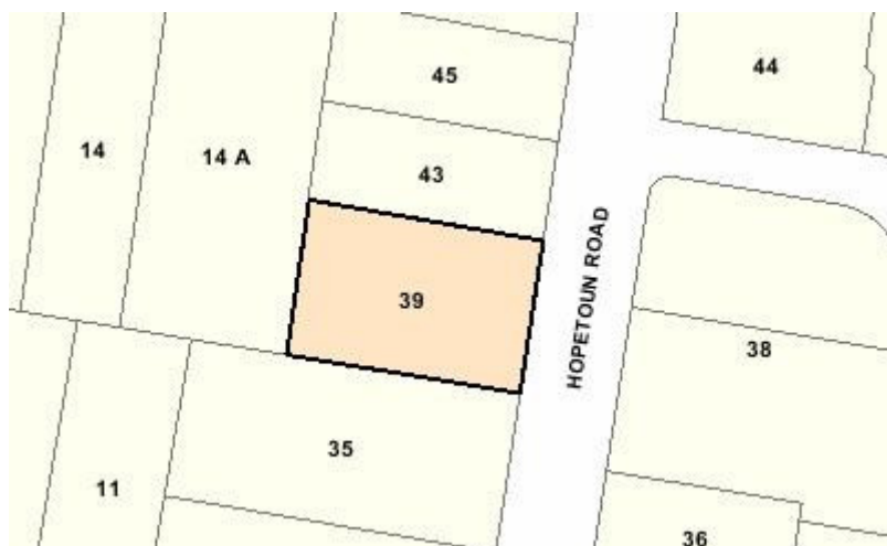
Recommended extent of heritage overlay for 39-41 Hopetoun Road, Toorak.