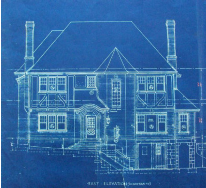
Extract from the 1932 building application plans showing the Hopetoun Road elevation.