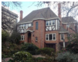
39-41 Hopetoun Road, Toorak