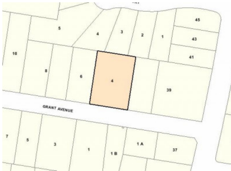
Recommended extent of heritage overlay 4 Grant Avenue, Toorak.