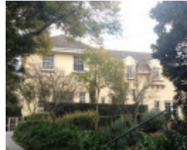
219 Kooyong Road, Toorak