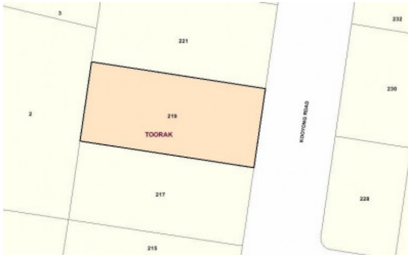
Recommended extent of heritage overlay for 219 St Georges Road, Toorak.