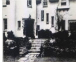
Front entrance to 219 Kooyong Road, c1934.