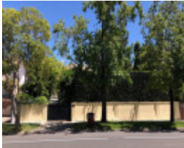
219 Kooyong Road, Toorak