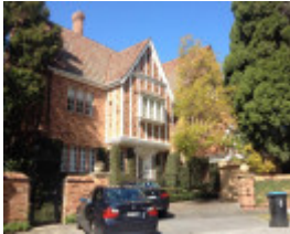
2 Ledbury Court, Toorak