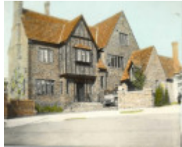
2 Ledbury Court, c1930.