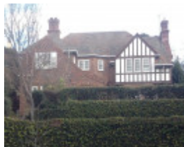
221 Kooyong Road, Toorak