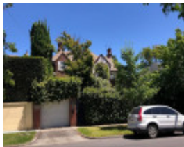
221 Kooyong Road, Toorak