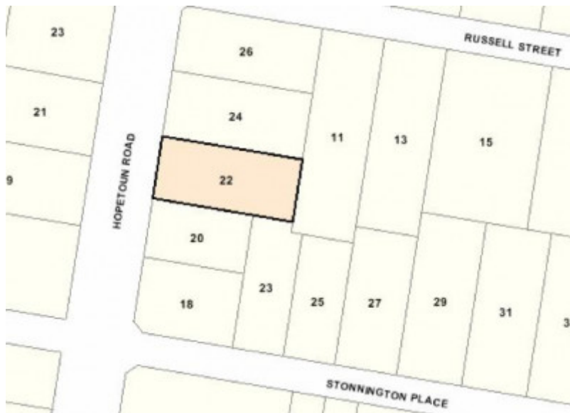
Recommended extent of heritage overlay for 22 Hopetoun Road, Toorak.