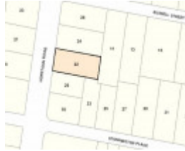
Recommended extent of heritage overlay for 22 Hopetoun Road, Toorak.