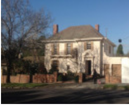
22 Hopetoun Road, Toorak