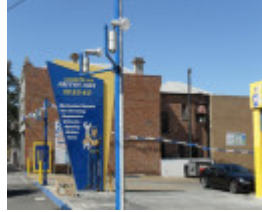
57-59 Fletcher Street