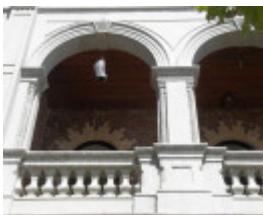
57-59 Fletcher Street