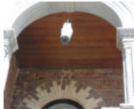
57-59 Fletcher Street