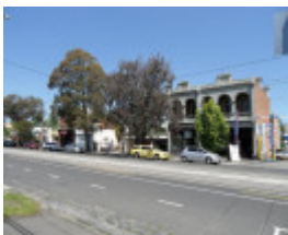
57-59 Fletcher Street