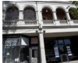
57-59 Fletcher Street