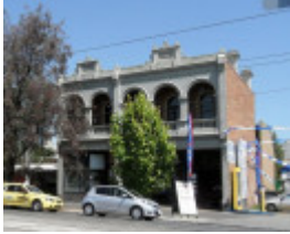
57-59 Fletcher Street