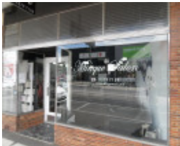
349-355 Keilor Road