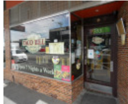
349-355 Keilor Road