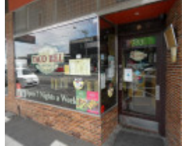
349-355 Keilor Road