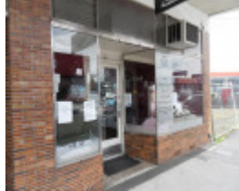
349-355 Keilor Road