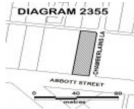
Sandringham_Masonic_Hall_d Sandringham_Masonic_Hall_s Diagram 2355.JPG