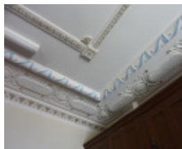
Sandringham_Masonic_Hall_c of upper_foyer.JPG