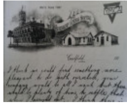
Letterhead from WWI Showing Main Buildings from Caulfield Repat