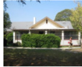
Former Red Cross Rest House