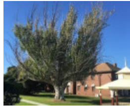
Former Red Cross Rest House