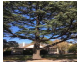
Former Red Cross Rest House