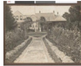
Former Red Cross Rest House