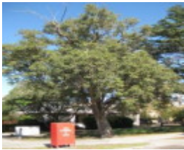
Former Red Cross Rest House