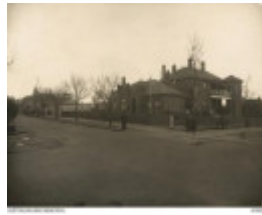
Former Red Cross Rest House