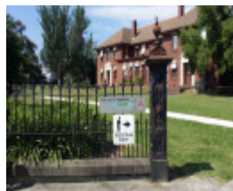
Former Red Cross Rest House