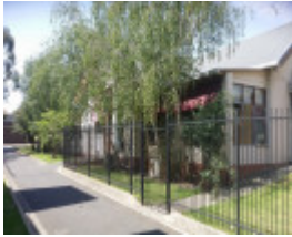
Montgomery Red Cross Rest Home 2016