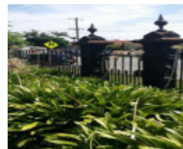
Former Red Cross Rest House