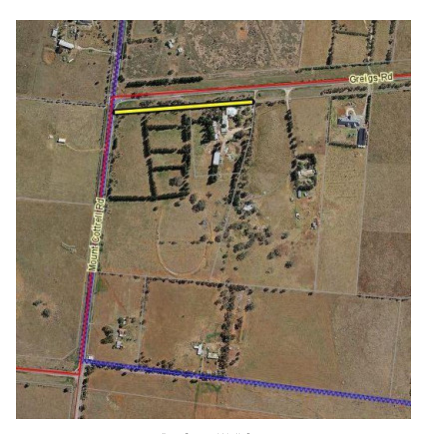
Dry Stone Wall C50