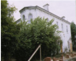
eyre court canterbury side view