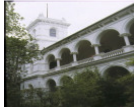
1 eyre court canterbury arcaded balcony