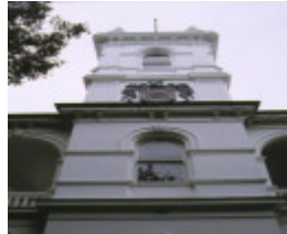
eyre court canterbury tower view