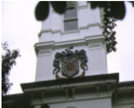
eyre court canterbury detail of tower