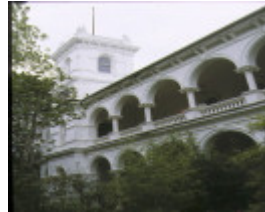
1 eyre court canterbury arcaded balcony