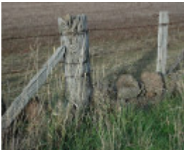
Dry Stone Wall R248