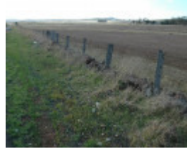
Dry Stone Wall R248