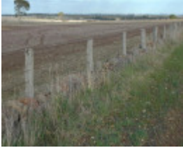
Dry Stone Wall R248