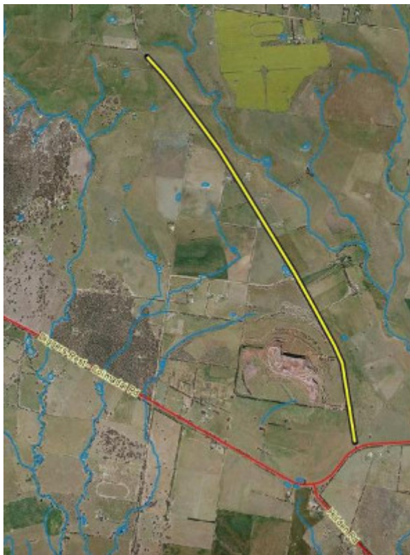
Dry Stone Wall R248