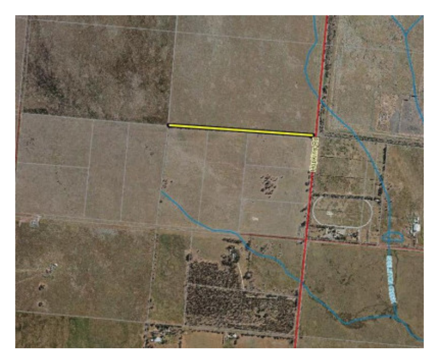
Dry Stone Wall B130