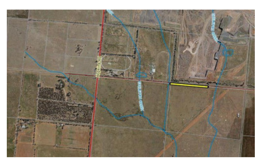
Dry Stone Wall B43