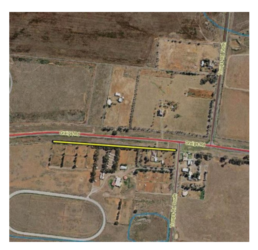
Dry Stone Wall C70