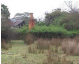
Ruins of conservatory (H7)