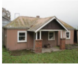
Worker's Cottage 1 (H2)