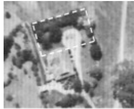
Farmhouse garden and driveway loop (H17)