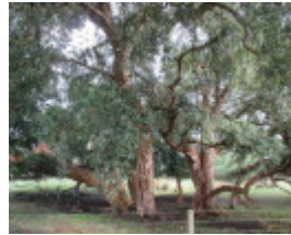
Cork trees (H10)