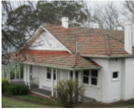
Weatherboard Farmhouse (H12)