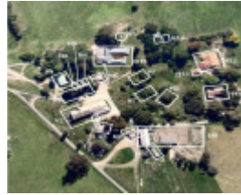
Figure 1 - Aerial