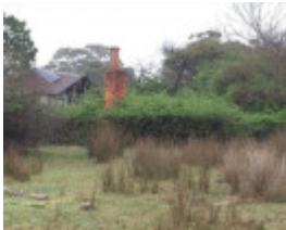
Ruins of conservatory (H7)