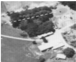
Avenue of Trees (H16)