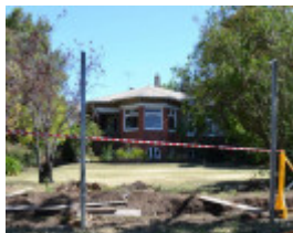
1 Stephen Street, Newtown