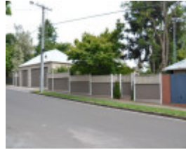
3 Stephen Street, Newtown