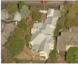
3 Stephen Street, Newtown - aerial view