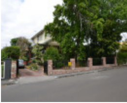
4 Stephen Street, Newtown